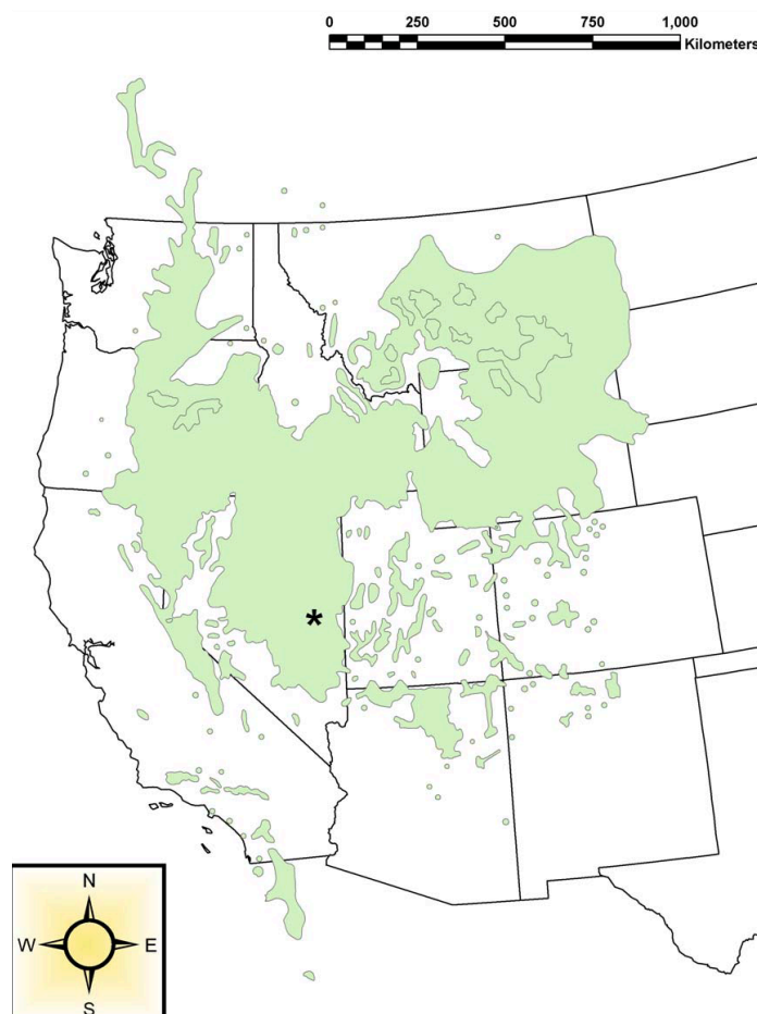
Figure 1 Distribution of big sagebrush ( Artemisia tridentata Nutt.) in North America, with location of the study area (asterisk).

erator mass spectrometry (AMS) 14 C analysis was employed to test the annual nature of xylem layers in subtropical trees that could not be crossdated (Biondi and Fessenden 1999), or to verify growth years assigned using stable isotopic values in tropical species (Poussart et al. 2004). In general, when tree growth increments have unclear boundaries but vary in size from one year to the next, accurate dating can only be obtained by combining 14 C dating with macro- and microscopic descriptions of the wood and its layers (Worbes and Junk 1989; Dezzio et al. 2003). In this paper, we used a combination of dendrochronological crossdating and 14 C AMS analysis to answer the question, "Are growth rings of Artemisia tridentata truly annual?" The answer to this question has immediate implications for the broader issue of reconstructing environmental changes in semi-arid shrublands.