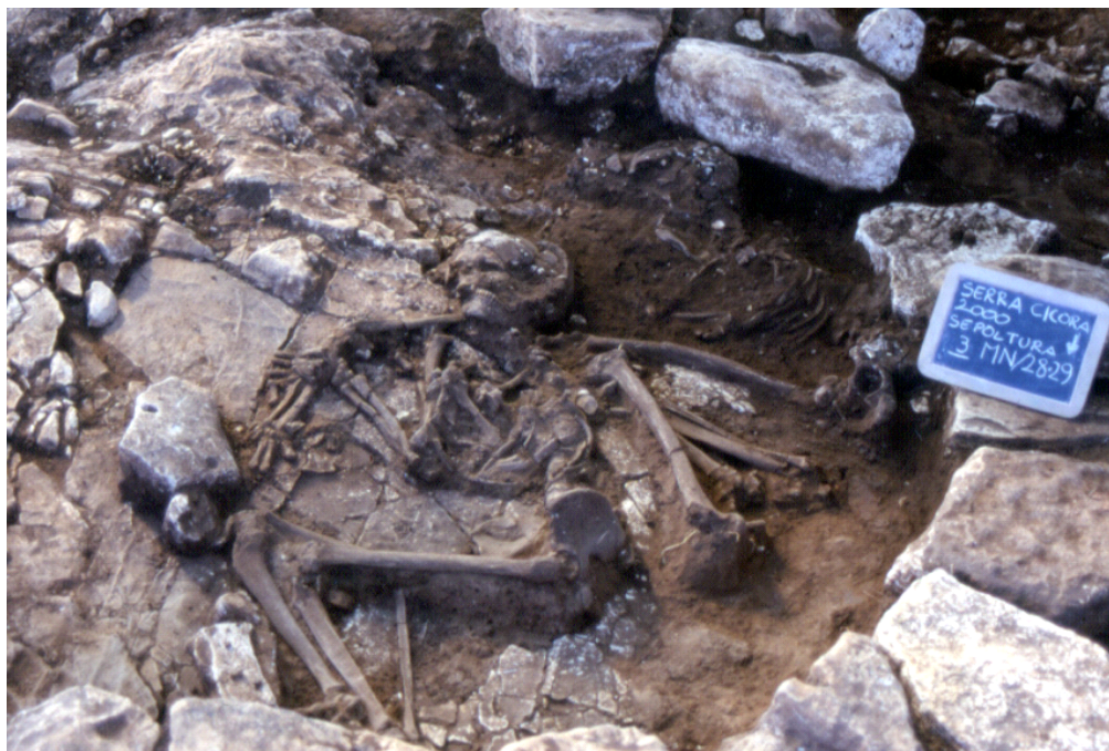
Figure 1 One of the dated individuals (T3 IND.A-Sect V) in one of the characteristic circular burials of Serra Cicora

For the preparation of the bone samples, a modified method by Longin (1970) was used to extract the collagen fraction (D'Elia et al. 2004; Gillespie et al. 1984). In particular, an additional alkali solution (0.2M NaOH for 30 min) was added before the collagen solubilization in hot water (85 °C), and acidified at pH = 3 with HCl for about 8 hr.