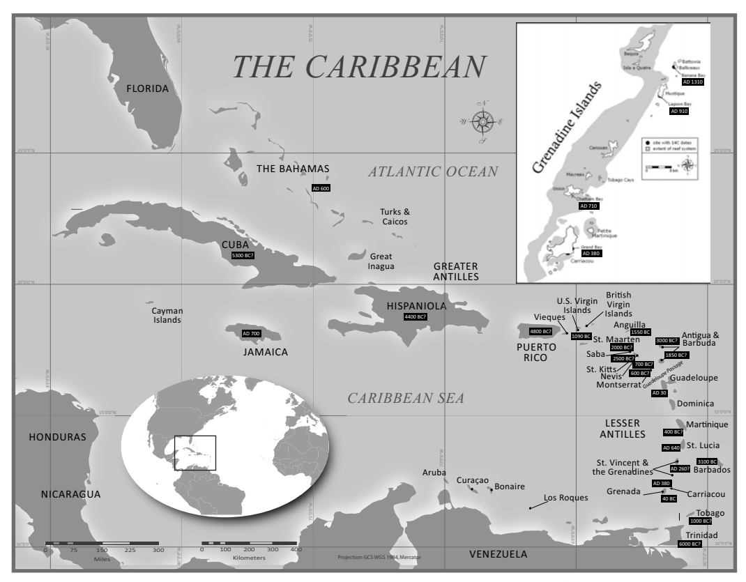
Figure 1 Map of the Caribbean with inset of the Grenadines showing the earliest acceptable {}^{14} C dates (2 \sigma ) found on each island in the Antilles (data from Fitzpatrick 2006; Wilson 2007; Cooper 2010; Rodríguez Ramos 2010).

between Grenada and St. Vincent in the southern Caribbean (Figure 1). The Grenadines lie on the southern Lesser Antilles arc platform (SLAAP) between the 2 most active volcanoes of the Lesser Antilles magmatic arc—the subaerial St. Soufriere Volcano on St. Vincent (Heath et al. 1998a) and the submarine volcano Kick'em Jenny between Grenada and Carriacou (Heath et al. 1998b). The arc is a product of Miocene uplift (23–16 Ma) and characterized by Eocene to Pliocene extrusive to intrusive igneous rocks along with sedimentary rocks such as limestone, marl, and chert, and epiclastic arc-derived volcaniclastic units composed of mudstone, sandstone, and conglomerate (Speed et al. 1993; Donovan et al. 2003; Jackson et al. 2008). The islands are comprised of a variety of volcanic and sedimentary rocks. Recent volcanism is limited primarily to Kick-Em-Jenny (Speed et al. 1993; Devine and Sigurdsson 1995; Lindsay et al. 2005) though the smaller islands just north of Grenada, including Isle de Caille, are considered to be volcanically youthful (Sigurdsson and Shepherd 1974).