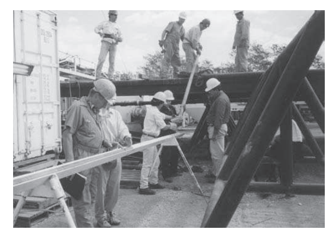
Fig. 2a. Drilling operations at Hacienda Yaxcopoil.

an automated digital core scanner were available for documentation. Cores were transported from the drill site daily, and information was made available on the CSDP web site through the ICDP information system. After completion of drilling operations, cores were packed and shipped to the UNAM Core Repository in Mexico City. Cores were further examined and then cut longitudinally in halves (one half is the project archive, while the other one is available for sampling