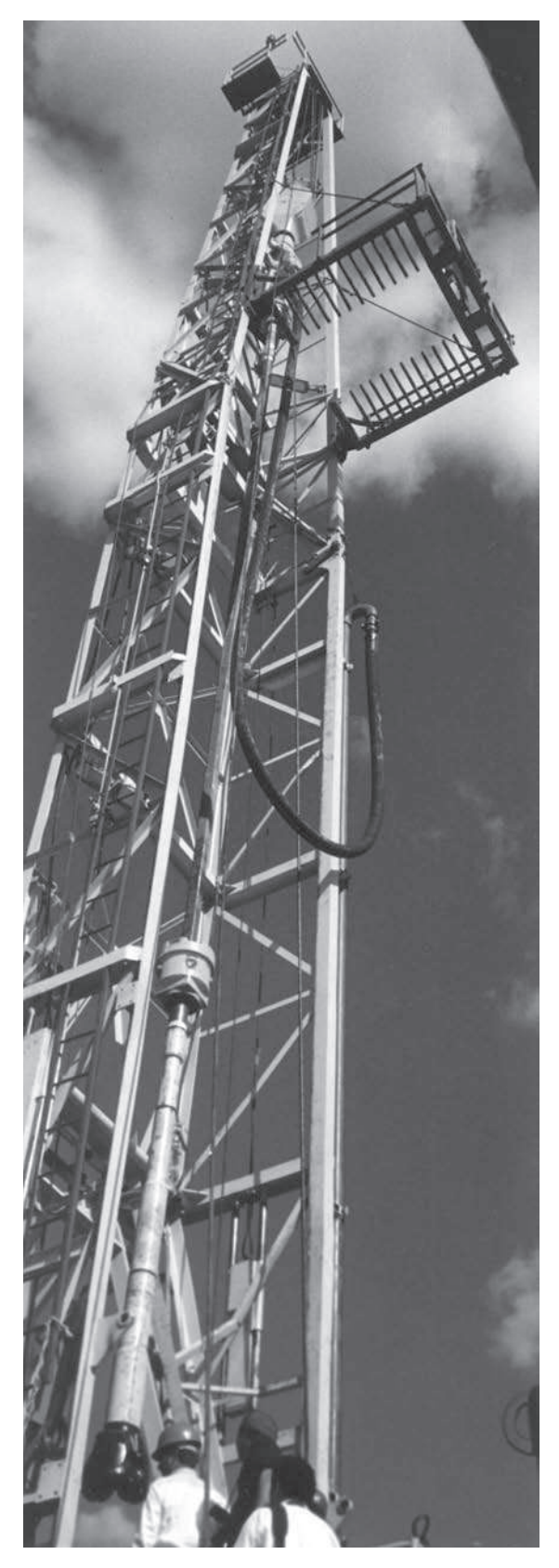
Fig. 2b. The CSDP rig at Hacienda Yaxcopoil.

has been proposed in Dressler et al. (2003) and in other papers included in these volumes (e.g., Tuchscherer et al. 2004; Stöffler et al. 2004). The Cretaceous sedimentary rocks below about 895 m are cut with dikes of polymict breccias and display zones of monomict brecciation. They appear to represent "megablocks" displaced by the impact event. Anhydrite layers, the thickness of which varies from a few centimeters to up to 15 m, and make some 27% of the megablocks. Organic-rich layers and oil-bearing units are present at depths between 1410 and 1455 m (according to Kenkmann et al. [2004], this layer starts at 1263 m.).