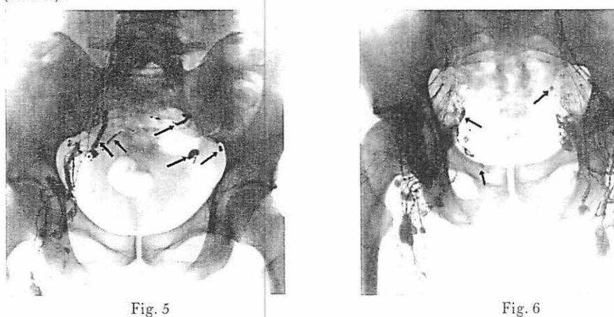
Fig. 5 S. M. Reticulum cell sarcoma. Stage II B prior to lymphography; stage III after lymphography. Bilateral obstruction of lymphatic circulation. Left iliac nodes replaced. Numerous l.v.c. (arrows).