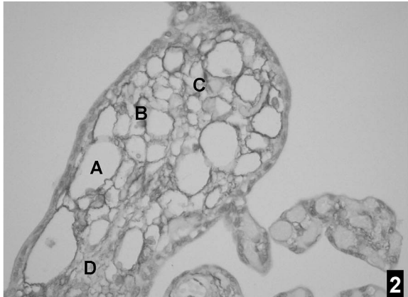
Fig. Immature intermediate villi from an at term hydropic placenta. Panel 1) Hematoxylin and Eosin (HE) staining (10x). Panel 2) Immunohistochemical D2-40 staining expression in placental immature intermediate villous tissue (10x). D2-40 is a selective marker of lymphatic endothelium. Tissue was formalin fixed, paraffin-embedded, and stained with D2-40 (1:120) for 60 min at room temperature. Podoplanin is a transmembrane mucoprotein that is recognized by the D2-40 monoclonal antibody. A: Ectasia. B: Hofbauer cell. C: Blood vessel. D: Stroma.

observation (9) point to the possible involvement of lymphatic vessels in the placental functions. The D2-40 expression at the placental stromal level seems to indicate that network-forming, podoplanin-expressing cells which do not form regular lymphatic vessels may act as a reticular-lymphatic-like conductive network positively involved in placental fluid homeostasis. Many questions are still awaiting answers. This is a fascinating research area of investigation for all who are involved in perinatology and lymphology.