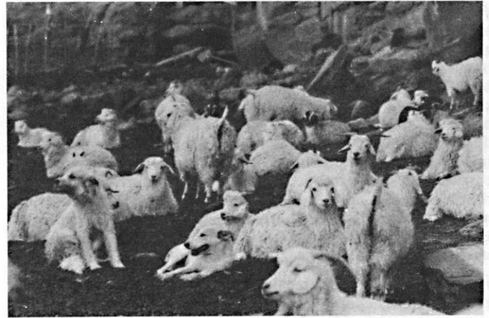
Fig. 2. Two mixed-breed Navajo dogs at rest with corralled Spanish goats on a homestead on the Navajo Reservation.

On the homesteads visited, 230 mixed-breed dogs were used as livestock protection dogs, hereafter referred to as LPD's (not to be confused with the house dog and stray population of dogs observed throughout the reservation). Navajos refer to LPD's simply as sheepdogs (Fig. 2). Of the 200 dogs in which sex was determined,