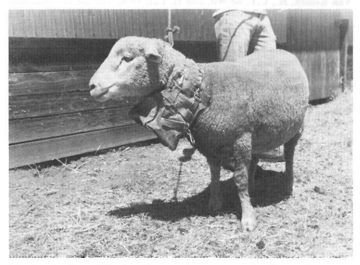
Fig. 1. Esophageal fistulated ewe with conventional collection bag.

The use of esophageal fistulated animals is a preferred method of collecting samples representative of the diet of a grazing animal (Van Dyne and Torell 1964, Rice 1970, Vavra et al. 1978, Johnson and Pearson 1981, McInnis et al. 1983). The conventional collection bag, a square canvas bag attached around the neck by 2 straps, provides an adequate means of collecting esophageal extrusa (Fig. 1). However, these bags are time consuming to fit to the animal and