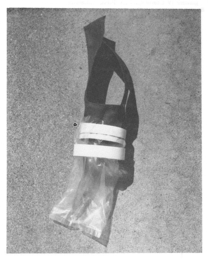
Fig. 3. Improved collection bag.

so they overlap each other by approximately 10 cm when wrapped around the neck of the sheep. Strips of hook and loop fastener (Velcro) are sewn to the ends of flaps "E" to provide a means of