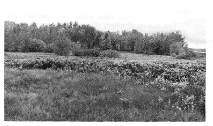
Fig. 1. A grassland of rough fescue-western porcupine grass, western snowberry shrubland and aspen forest in the central Alberta aspen parkland.

Fire temperature is usually highest a distance above ground. This distance varies with vegetation, fuel and weather