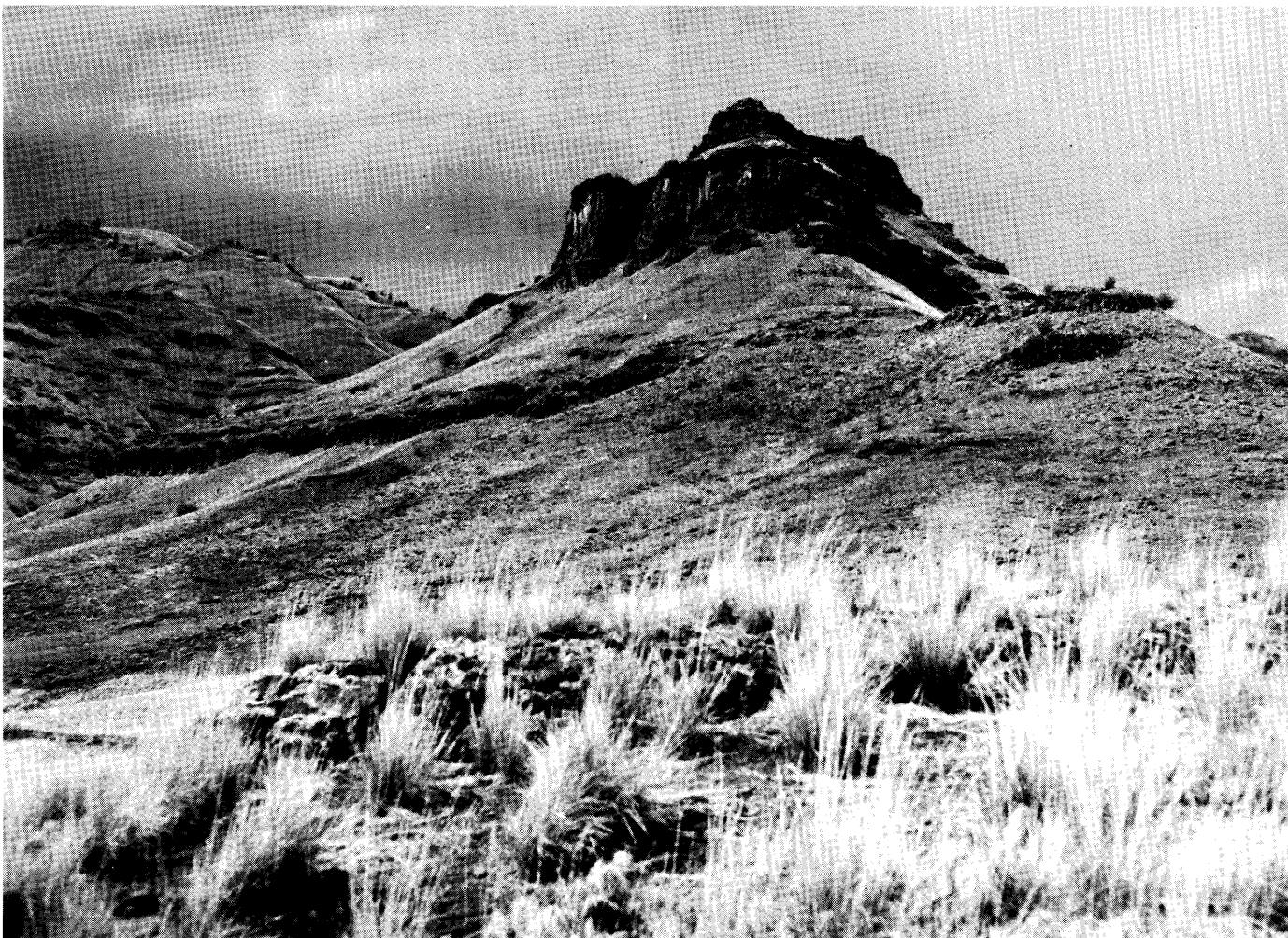
Coordinated resource planning integrates livestock use with wildlife habitat needs and other uses of the resource such as for watershed.

Resource planning and coordination, however, can take many forms. Historically, it has often reflected the objectives of those doing the planning and the values being sought. By and large, plans have been based upon maximizing commodity yields and in turn, economic returns. There is nothing wrong with such objectives. On the contrary, they are legitimate and essential. Until recently, statutory direction having to do with resource planning cast the objectives, participants, and criteria in primarily economic terms. Again, this is legitimate. The weakness has been in the dimension, because if an effective planning job is to be done, many values must be considered, not all of which have been sufficiently represented or understood.