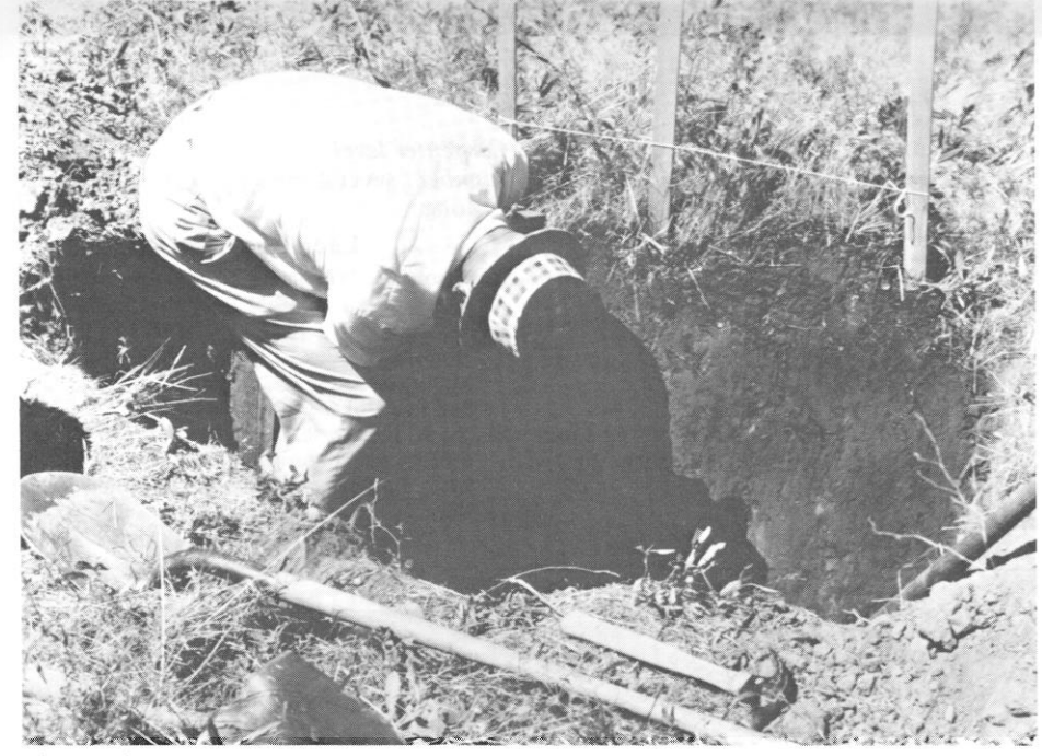
Fig. 1. Shows area marked off and soil face being smoothed down ready to apply the thick solution of cellulose acetate.