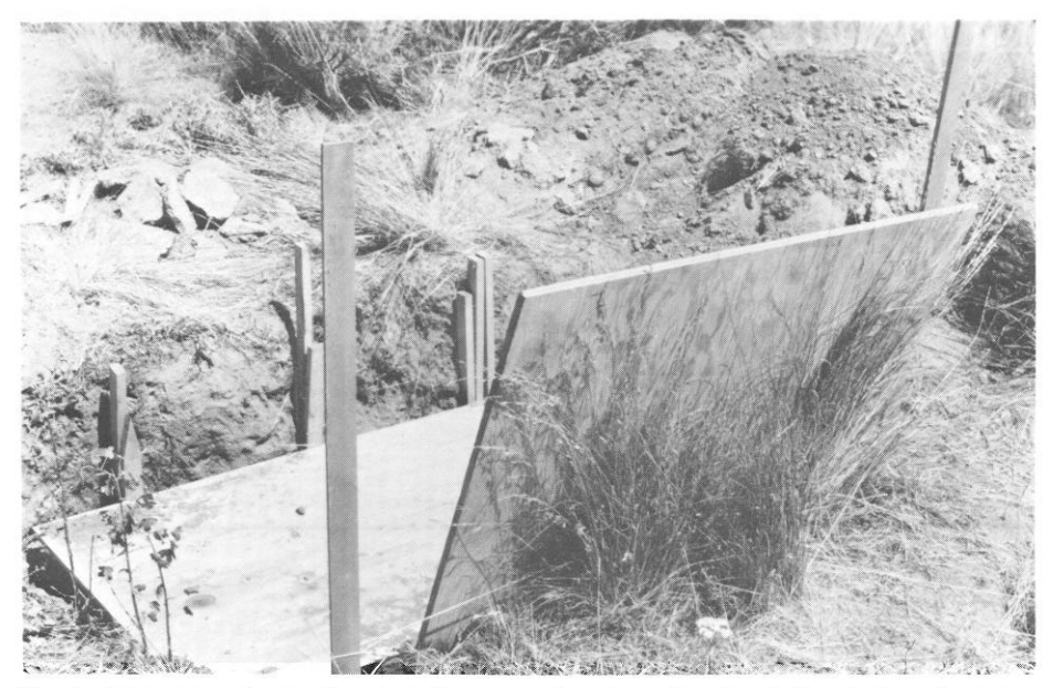
Fig. 2. Display board placed against the prepared surface after the thick solution of cellulose acetate has been applied.

140 g of cellulose acetate in sufficient acetone to make 1 gal of solution. Spray this solution until it has penetrated approximately 1/2 inch, being careful not to let a film form. This spray fixes the soil. Let the penetrating solution dry about 30 minutes or until the surface is not sticky.