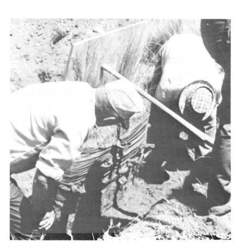
Fig. 3. Tying the range soil monolith to the display board before removing from the pit.