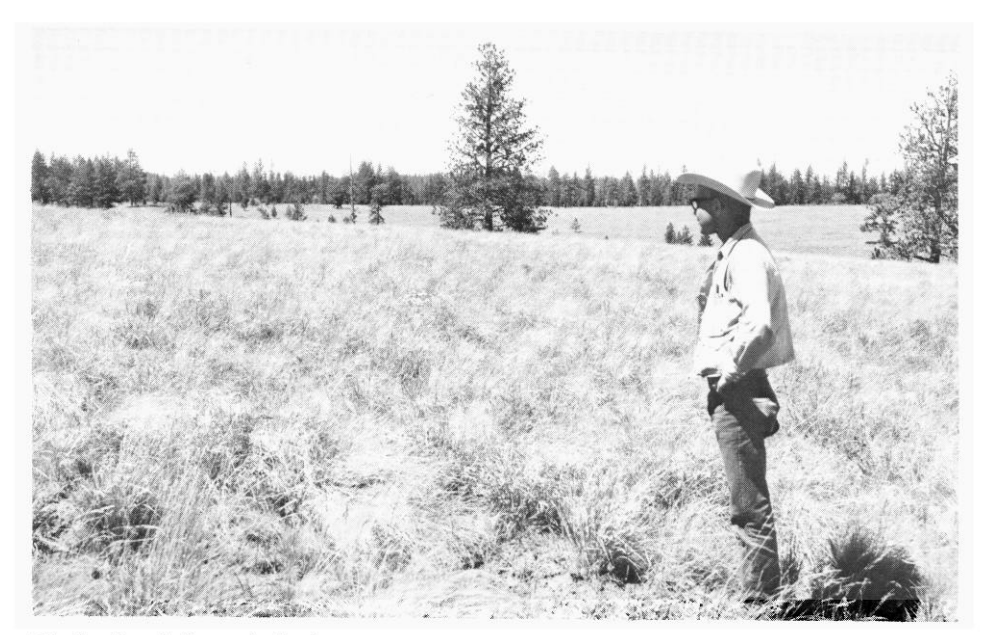
Fig. 2. Rough fescue is the dominant grass in this high elevation mountain grassland area. It also extends into the ponderosa pine-Douglas fir in background.

fescue associated in the Festuca idahoensis-Eriogonum heracleoides, and Festuca idahoensis-Symphoricarpos albus habitat types while studying the steppe vegetation of Washington. To some extent, it is also associated in the Pinus ponderosa-Symphoricarpos albus habitat type (Daubenmire, 1968).