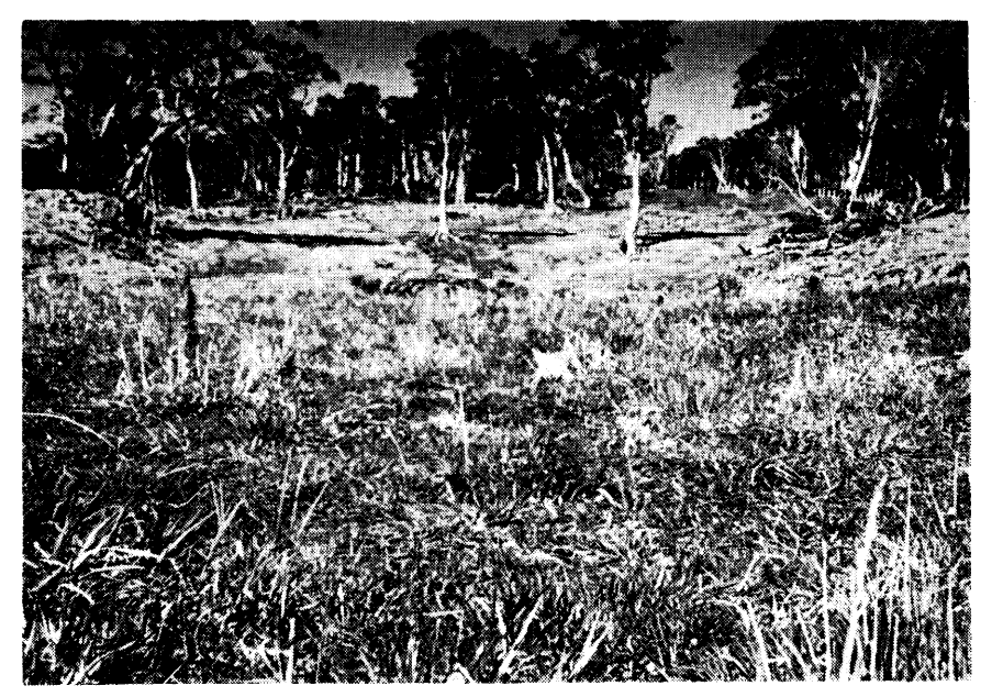
FIGURE 2. Pasture of temperate zone grasses and legumes established on rough field formerly occupied by rain forest vegetation.

ranges can usually graze the year round, but production in the winter is much less than in summer due to colder temperature and shorter length of day.