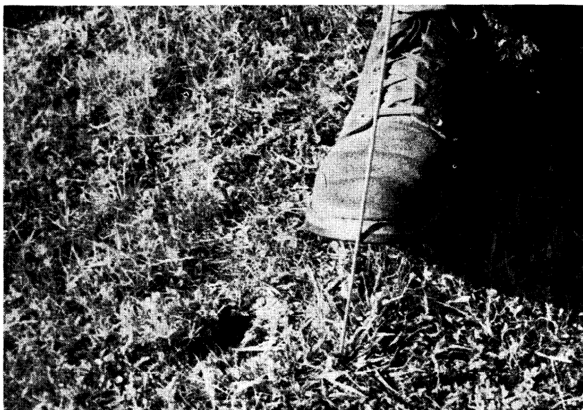
FIGURE 1. The sampler is establishing a sampling point with the use of a pin and a notch on the toe of his boot—the step-point.

In step-point sampling a single pin is used rather than pins grouped in a frame. An individual step-point is established by the sampler lowering the sampling pin to the ground, guided by a definite notch on the toe of his boot (Fig. 1). At each step-point the sampler places his boot at a 30° angle to the ground to avoid disturbing plants in the immediate vicinity,