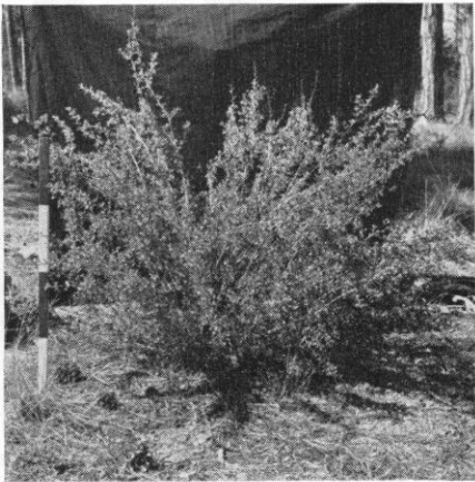
FIGURE 1. No browsing or clipping of this antelope bitterbrush plant for four years resulted in a shrub with an open crown and little current twig growth. Most of the leaves are borne in tiny clusters or "spurs" on old wood. Witness stake in this and following photographs is graduated in 6-inch units.

In the first two bitterbrush exclosures, heavy and complete clipping practically prevented height growth. By the fourth harvest, crowns of plants under these