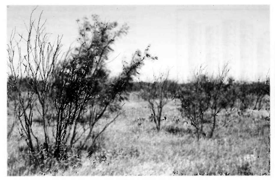
Fig. 3. Ground-level view of a mesquite plot at Kite Trap in 2000 treated with clopyralid at 0.28 kg ha<sup>-1</sup> in 1996. None of the mesquite in view have basal regrowth. Vegetation at the base of the large tree on the left is grass growth.