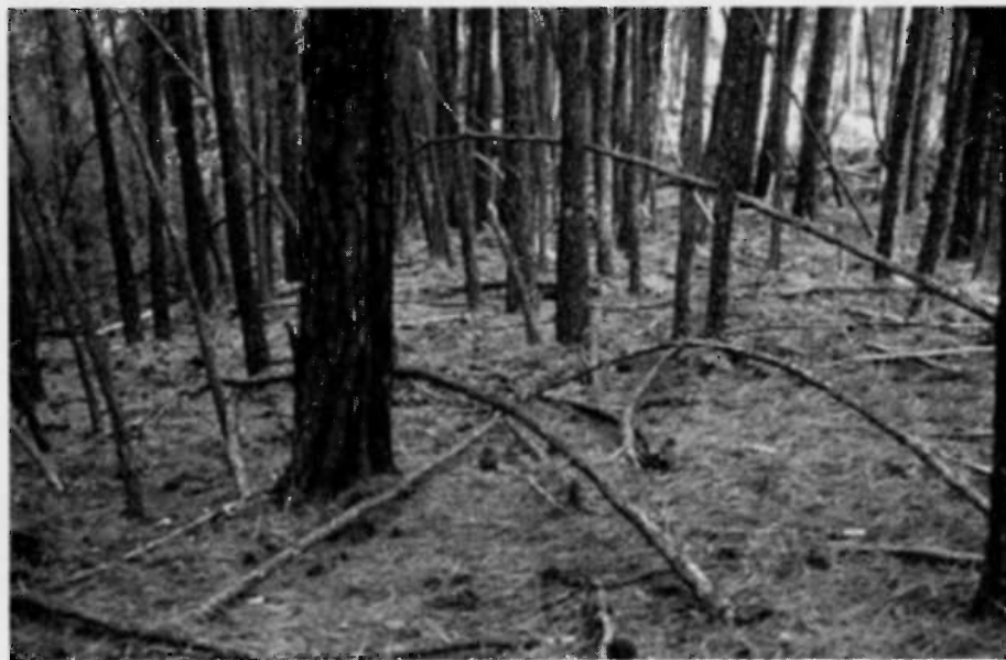
Fig. 5. Burned pine/litter habitat on winter range in the central Black Hills, South Dakota and Wyoming, 1993–1996.

years of the study because of high seasonal site fidelity (Progulske and Baskett 1958, Ozoga et al. 1982, Tierson et al. 1985, Kennedy 1992, Nelson 1995, Griffin et al. 1999). Because sufficient observations per animal ( \bar{x} = 52.96 \pm 5.20 ) were recorded (Alldredge and Ratti 1986, 1992) and because habitat availability was assumed to be equal for all radiocollared animals, a chi-square test of homogeneity was used to determine differences between expected and observed distributions of forest type, overstory-understory habitat, and structural stage (Jelinski 1991, Kennedy