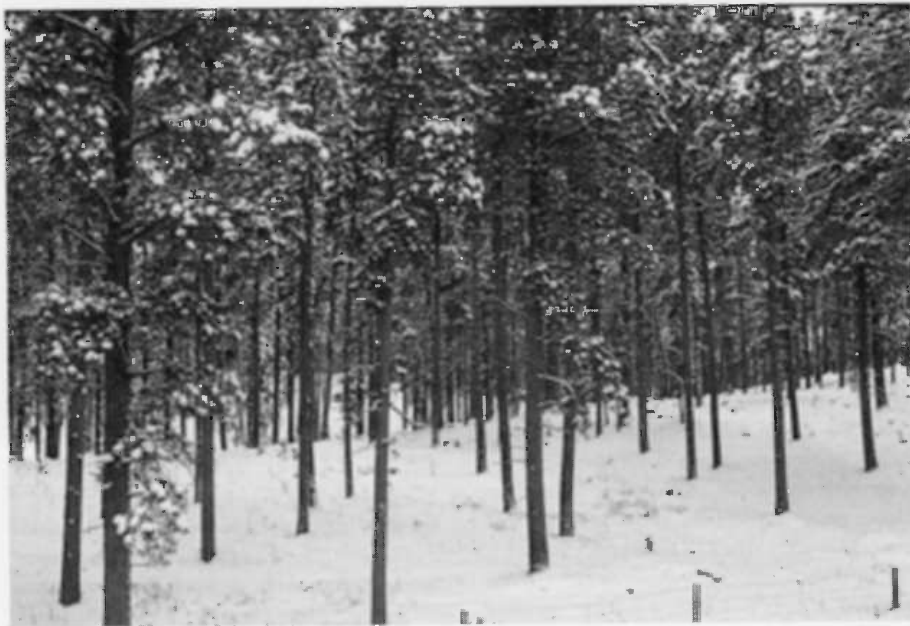
Fig. 7. Pine habitat on winter range in the central Black Hills, South Dakota and Wyoming, 1993–1996.

Rice 1991), deer reproductive success (Rice 1984, Hauk 1987, McPhillips 1990, Hippensteel 2000), and fawn survival (Rice 1979, Benzoni 1998) have not increased with herd reductions, Griffin et al. (1992) reported that most management agencies believe the long term population decline and low productivity affecting central Black Hills white-tailed deer are directly related to habitat deterioration. In the central Black Hills, Hippensteel (2000) determined that winter range diets