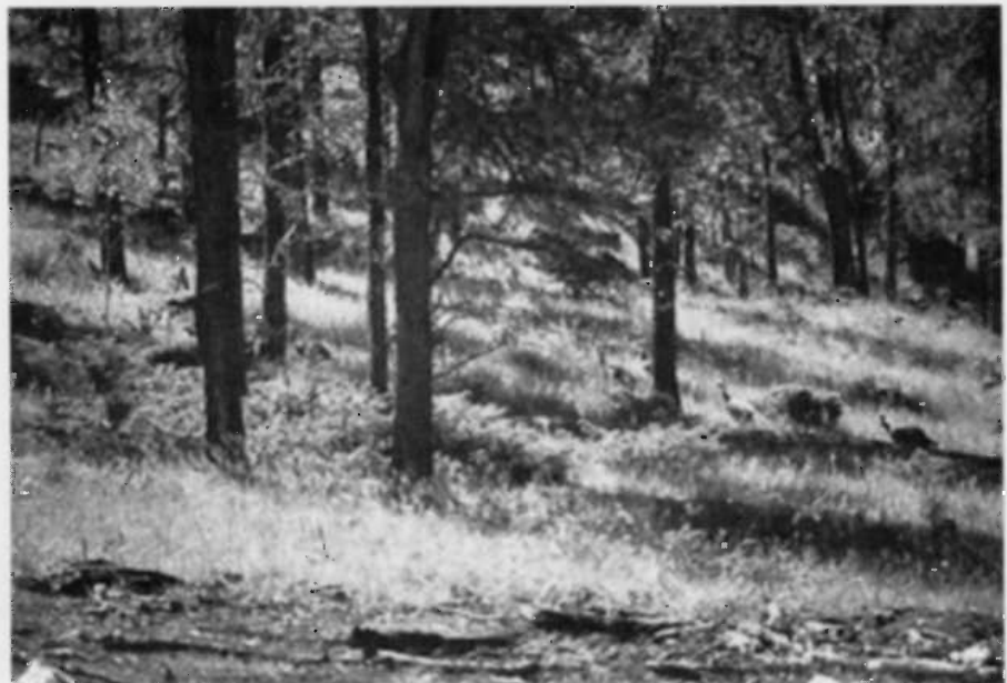
Fig. 6. Pine/juniper habitat on summer range in the central Black Hills, South Dakota and Wyoming, 1993–1996.