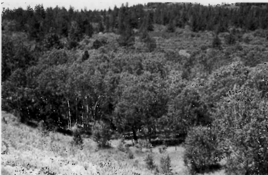
Fig. 3. Aspen habitat on summer range in the central Black Hills, South Dakota and Wyoming, 1993–1996.