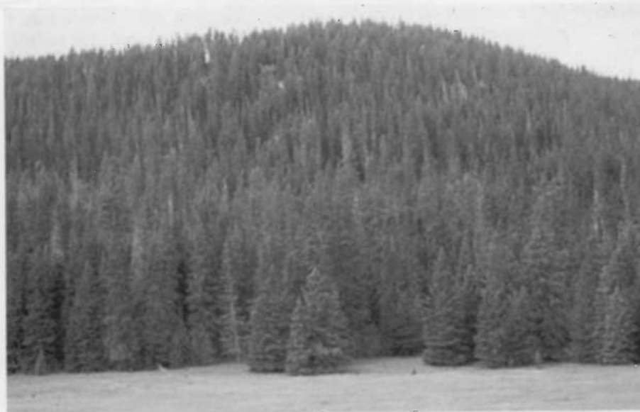
Fig. 8. Spruce habitat on summer range in the central Black Hills, South Dakota and Wyoming, 1993–1996.

Burned pine forests were selected by white-tailed deer during winter but not during summer (burned habitats are rare on summer range). Burning speeds organic matter decomposition rates and releases nutrients into the environment, promoting the production of forage higher in protein (Einarsen 1946, Swank 1956, Sieg and Severson 1996). Similarly, researchers have concluded that burning in an unthinned ponderosa pine stand removed the litter component, initially increased the nutrient value of the herbaceous vegetation, and stimulated growth of grasses, forbs, and shrubs, thereby increasing the quality of the vegetation (Krefting 1962, Pearson et al. 1972, Harestad and Rochelle 1982). However, most larger burned areas within the central Black Hills are > 40 years post-burn. Browse production increases for 3–5 years following a burn before returning to pre-burn levels (Lay 1957, Taber and Dasmann 1957, Pearson et al. 1972). Consequently, deer use of burned areas may have been detected because forage species (e.g., bearberry, snowberry, and juniper) important to deer (Hill 1946, Schneeweis et al. 1972, Schenck et al. 1972) are essentially absent in the dominant unburned pine communities of the central Black Hills.