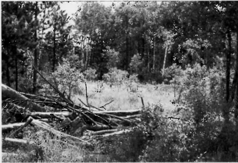
Fig. 4. Aspen/coniferous habitat on summer range in the central Black Hills, South Dakota and Wyoming, 1993–1996.