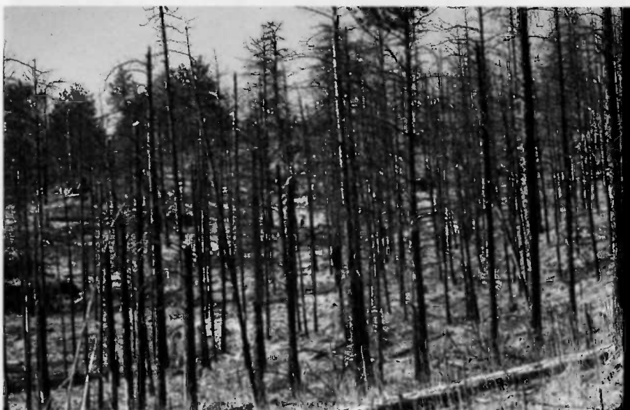
Fig. 2. Burned pine habitat on winter range in the central Black Hills, South Dakota and Wyoming, 1993–1996.

Forest type, overstory-understory habitat, and structural stages were pooled across individuals, years, and activities by season. Deer locations were pooled for all