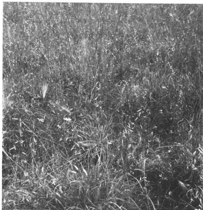
Fig. 1. Study site of the foothill grassland. Bunchgrass in the foreground is Andropogon ischaemum ; tall grass in the background is Chrysopogon gryllus .

Five quadrat sizes, 0.0625, 0.125, 0.250, 0.500, and 1 m 2 , and three quadrat shapes, square, rectangular, and circular were tested. For each size and shape combination five samples were taken from each of three blocks, 10 × 10 m 2 , which were selected and located about 50 m apart. Table 2 shows the characteristics of quadrats used in the experiment. From here on, the five quadrat sizes are referred to as 1, 2, 3, 4, and 5 from the smallest to the largest size, respectively.