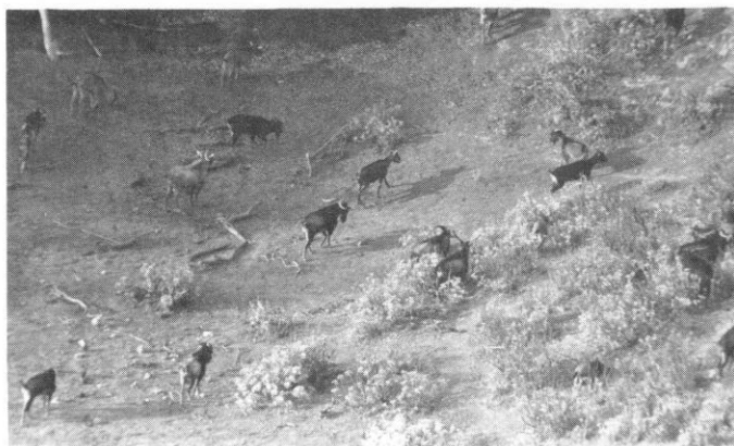
Fig. 2. Some of the 5,000 to 8,000 goats on Catalina Island.

The chaparral community was a complex of chaparral types. The dominant members of the community varied with location. The most frequent dominant was scrub oak ( Quercus dumosa ), followed by chamise ( Adenostema fasciculatum ) and white lilac ( Ceanothus mega-