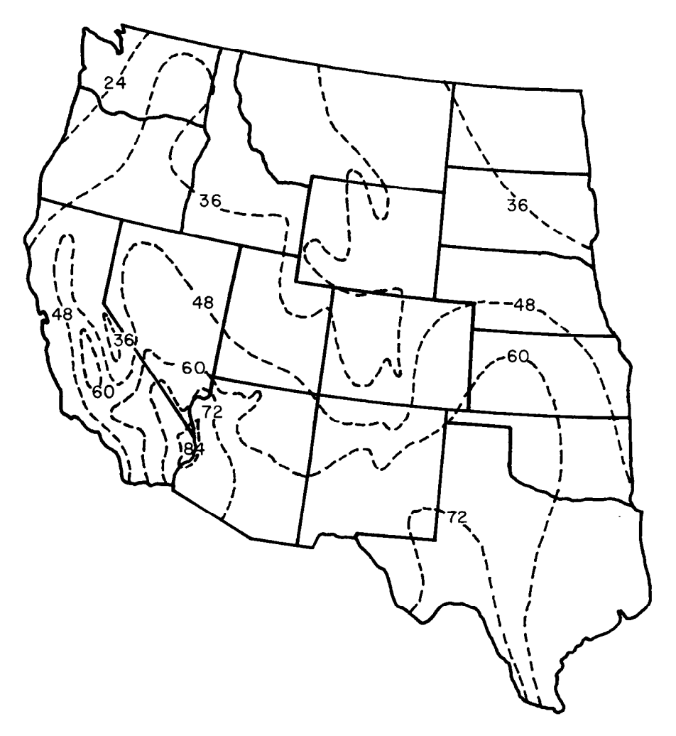
Fig. 1. Mean annual lake evaporation (inches) in the 17 western states (The Water Encyclopedia, 1970). Values for period 1946–1955.

Floating foam rubber sheets offer a means of suppressing evaporation. Low-density synthetic sheeting materials have recently been evaluated as floating evaporation barriers between the water surface and the atmosphere. Evaporation reduction on insulated evaporation tanks in Arizona (Cooley, 1970) was essentially equal to the percent of water surface area covered by light-colored floating sheets. Studies in Utah showed that sheets of