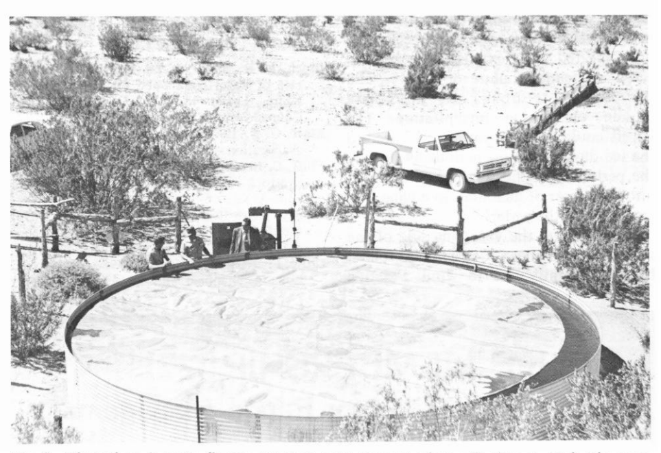
Fig. 3. Thirty-foot diameter floating cover on water-storage tank near St. George, Utah. The cover should be fabricated to fit the tank more closely than this one does.

two 30-ft diameter covers were installed in southern Utah in November 1971 on tanks belonging to the Bureau of Land Management (Fig. 3). One tank is southwest of St. George, Utah, and the other is northwest of Cedar City, Utah. The tank at Logan is in a moderate temperature, canyon wind area with ice present during the winter. The St. George location is in a high temperature area where little if any ice forms during the year. The tank near Cedar City is in a moderate temperature area, and ice is present during the winter.