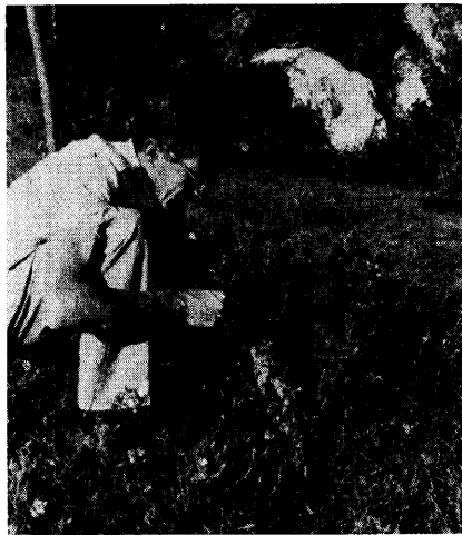
FIG. 2. The bayonet in field use.

bayonet recording give very small deviation (Poissonet, 1969) as compared to a needle point frame (Long et al., 1972).