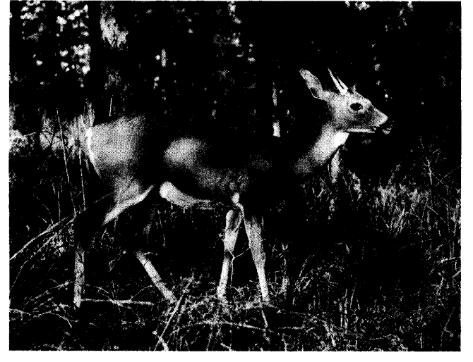
FIG. 1. Healthy deer can be sustained on properly managed pine-hardwood forests in the South.

and pole phases of rotation, when forage yields are usually low.