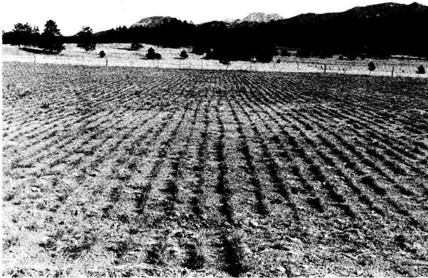
FIG. 2. Sherman big bluegrass planted in late July 1965. Photo October 6, 1965, Manitou Experimental Forest.

Seed Storage Laboratory in Fort Collins, Colorado, to determine the length of time big bluegrass normally requires to germinate and the temperature levels which provide good germination. The tests were made following standard procedures in germinators which controlled light, and the degree and duration of a temperature regime.