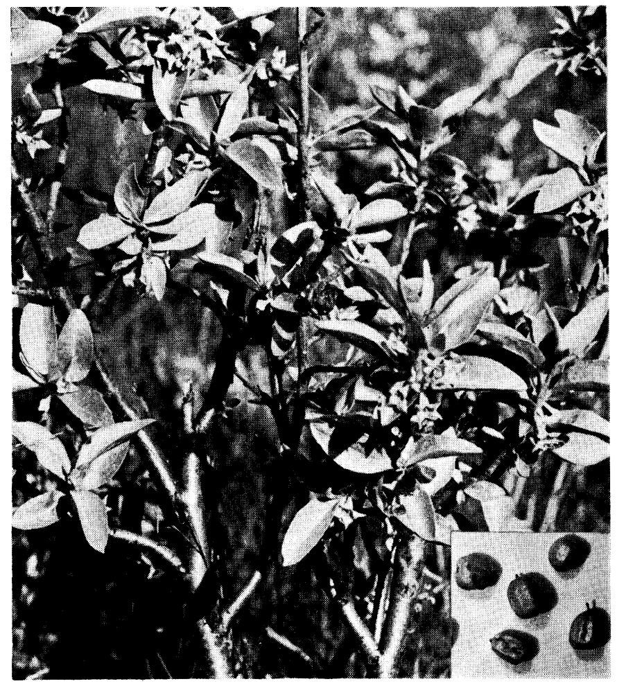
FIGURE 1. Flowering silverberry plant (Ca x ½) in native rangeland at Kinsella, Alberta. Fruit (Ca x ¾) in inset.