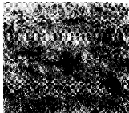
FIGURE 1. The grazed prairie is characterized by the uneven nature of the stand and the dominance of Andropogon scoparius .

The major dominant in the grazed prairie in 1950 was little bluestem. In 1959, the dominants in the grazed prairie comprised one midgrass (little bluestem) and one forb (western ragweed). By 1962, dominance was shared by little bluestem, western ragweed and sideoats grama. The other three prairie dominants and coralberry were present in the grazed prairie but not dominant (Table 1).