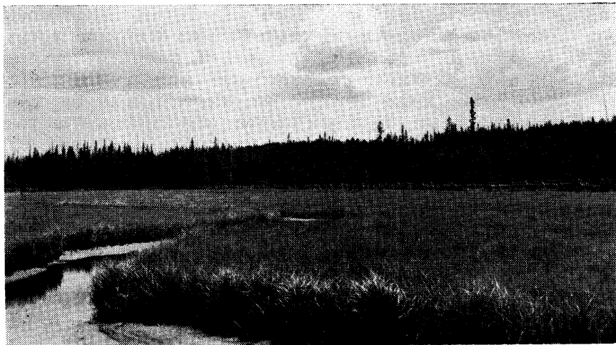
FIGURE 1. Sedge meadow under study in the spruce-alpine fir zone near Kamloops, B. C.

The meadow was dominated by a uniform, dense stand of sedges ( Carex ), along with lesser