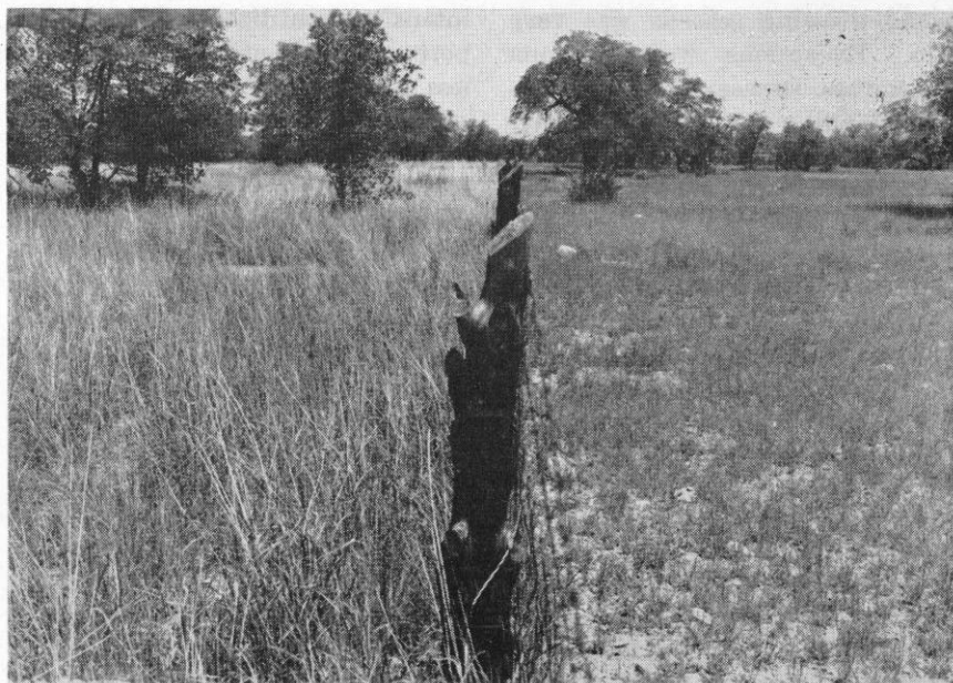
FIGURE 2. This area outside the experimental range is a striking example of differences brought about by grazing. The area to the left of the fence has been protected for 22 years. Vegetation is largely primary grasses including sideoats grama, cane bluestem ( Andropogon barbinodis ), and tall threeawns. The outside grazed range is composed mainly of curlymesquite, with a sprinkling of hairy, sprucetop, and sideoats gramas.

With the exception of side-oats grama, seedling survival of primary grasses was higher on ungrazed quadrats than on those open to