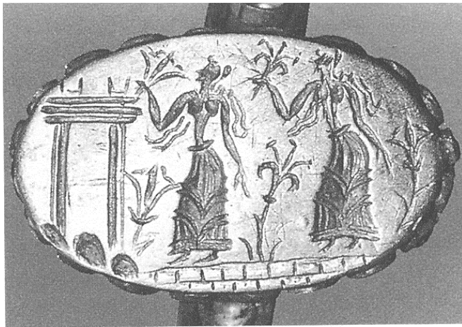
Figure 8: CMS VIB, 113

(iii) several of the Mycenae ‘Cult Centre’ deposits, and also a possible Mycenaean cult deposit near the sanctuary of Athena Itonia in Philia, Thessaly). 7 Conical cups are also common in Mycenaean cult contexts (just at the sanctuary of Apollo Maleatas were found over 100 fragments). Wiener has studied occurrences of FS 204 in the Mainland and considers the highest frequency of the shape to occur at Mycenae. 8 The predominance of vessel types intended for consumption of liquids (kylikes) or the consumption of either liquids or small meals (conical cups) raises the question of ritual feasting. The problem here is equifinality , the possibility that the same ceramic types would be used for similar ritual acts, which could belong to entirely different rituals. Communal eating and drinking, in particular, should be commonplace parts of many diverse rituals in the Bronze Age. The wide distribution of kylikes in many diverse contexts can be read in this way. 9