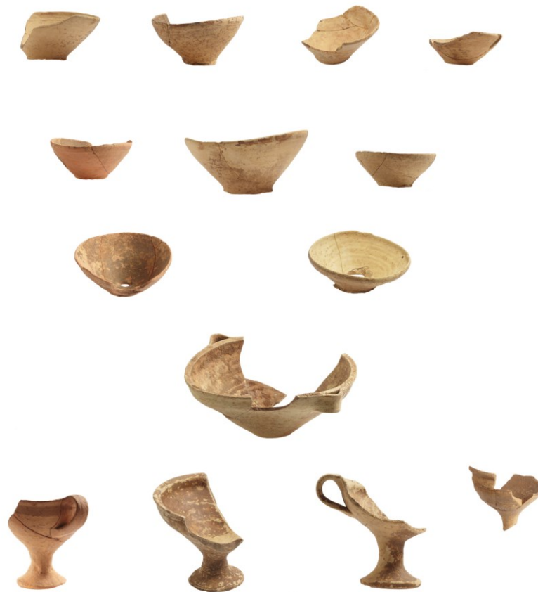
Figure 5: Kylikes and conical cups from the pit

In the period that follows (Period II), dating approximately from 1350 to 1200 BC (the late LH IIIA2-LH IIIB), the architectural character of the site changes drastically: several new buildings are constructed with a totally different orientation and organization, indicating a break in the architectural tradition of the settlement. The largest and most impressive structure is a building complex comprising three wings around an open courtyard. This complex has two or three storeys and was partially constructed on a massive Cyclopean Terrace, measuring 24 m. long and 8 m. wide. The “Cyclopean Terrace Complex” (abbr. CTC, Figure 3), as it has become known, was decorated with frescoes depicting ships and processions with female figures and yielded utilitarian and little fine pottery, human figurines, and clay offering tables. At about the same time a second large building (Building X), approximately 15 m. long, is constructed to the east of the CTC, on the other side of a paved piazza. A paved ceremonial street ending here from the east passes in front of Building X and ends up in the paved piazza. To the north, the houses of the previous phase are abandoned and new buildings are constructed on top of them. These buildings include a multi-room complex built around a megaron (“Megaron Γ”), extensive storage facilities, industrial installations (Unit E), and an elaborate system of massive drains and terracotta pipes.