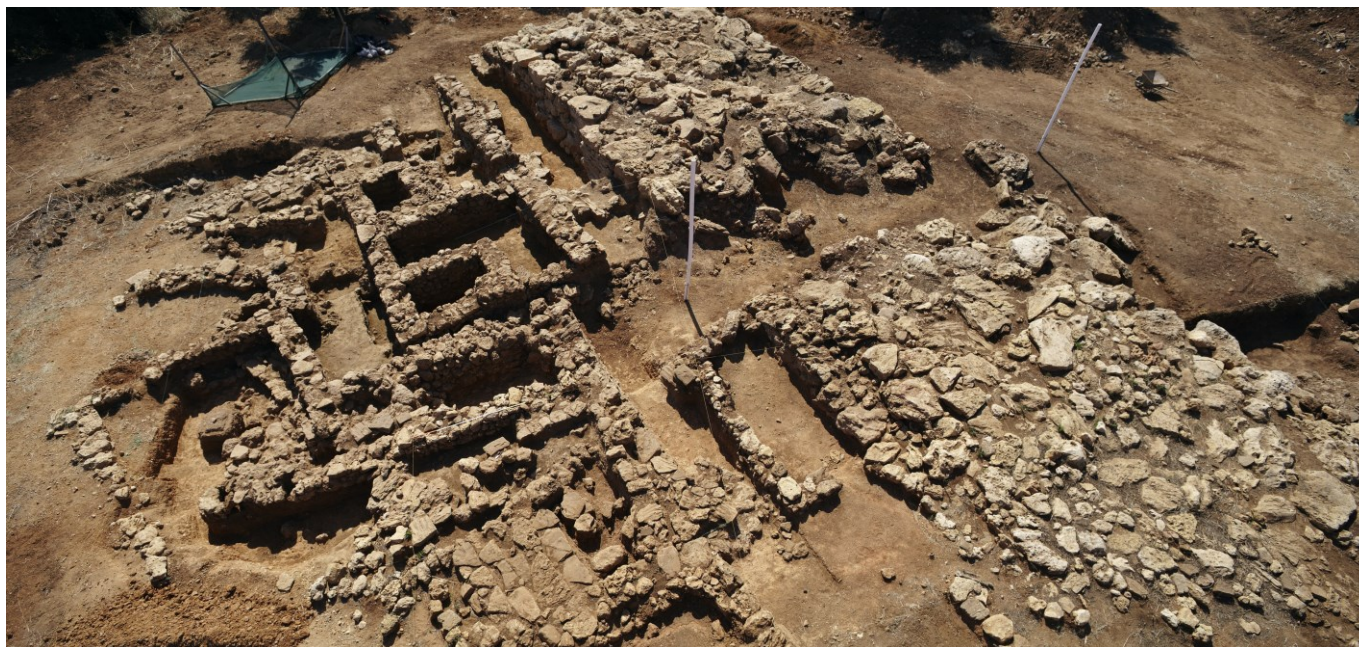
Figure 3: The Cyclopean Terrace from the North