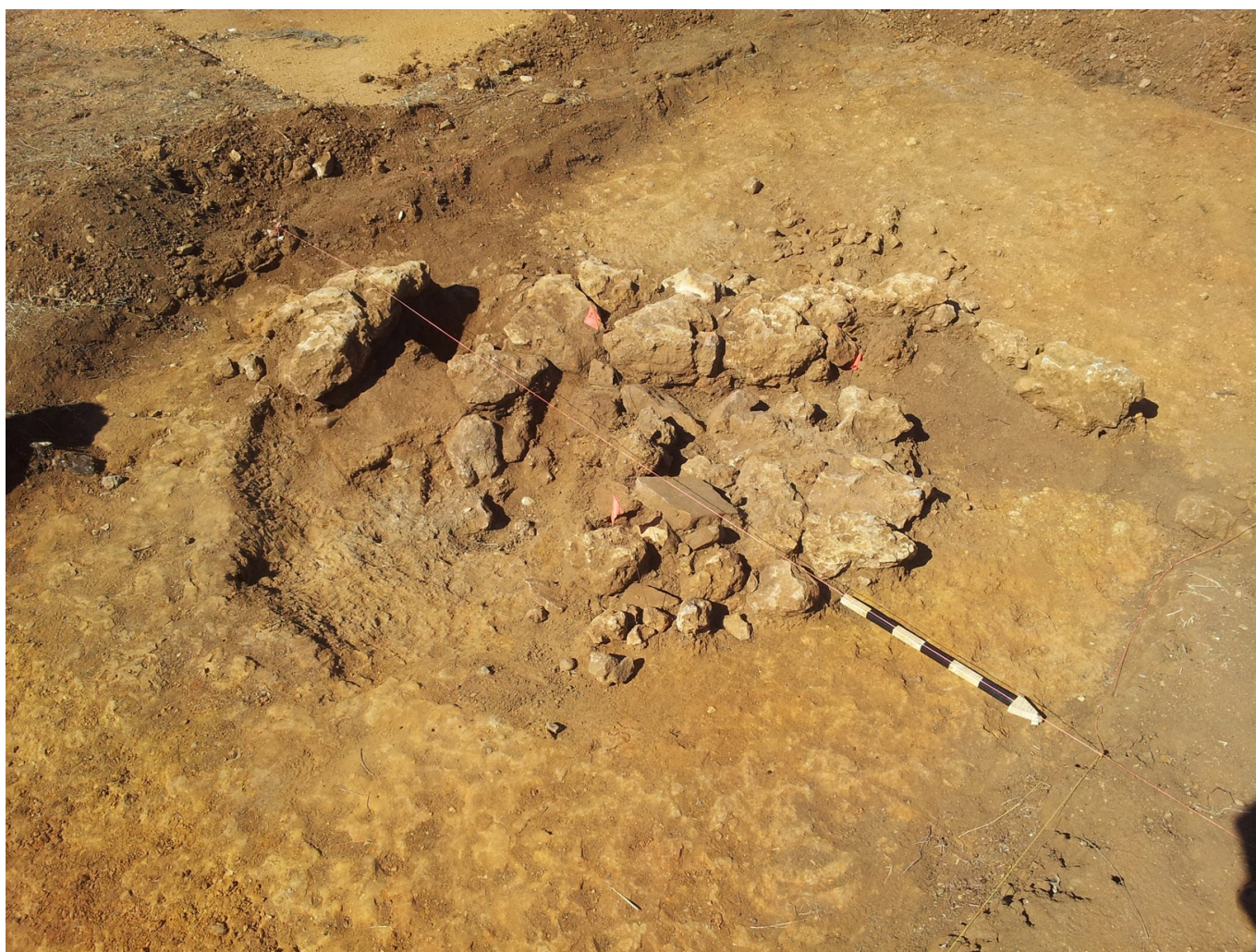
Figure 4: View of the pit from the northwest