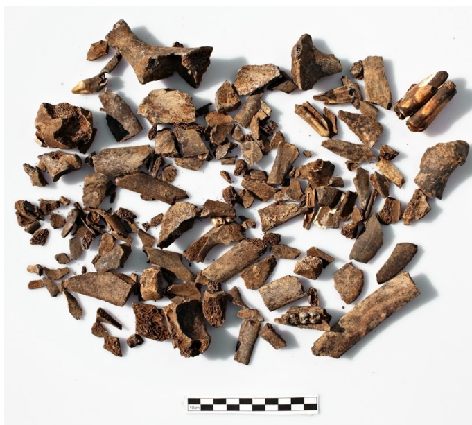
Figure 7: Burned animal bones from the pit

sheet of lead, fragments of painted plaster, fragments of a painted offering table, numerous sherds, and over fifty whole or nearly complete vases, the vast majority of which were conical cups and kylikes dating to LH IIIA1/III2; many of the conical cups were piled up inside each other. The pit contained also numerous bones from young (<18 mos.) animals, predominantly pigs, along with few bones from sheep/goat (Figure 7). As the bones did not have cutmarks, they are not waste burned after consumption, but were burned with the meat attached.