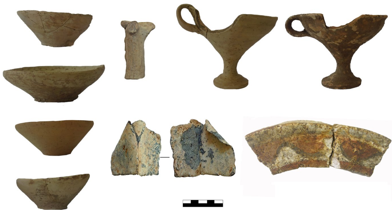
Figure 6: Miscellaneous finds from the pit