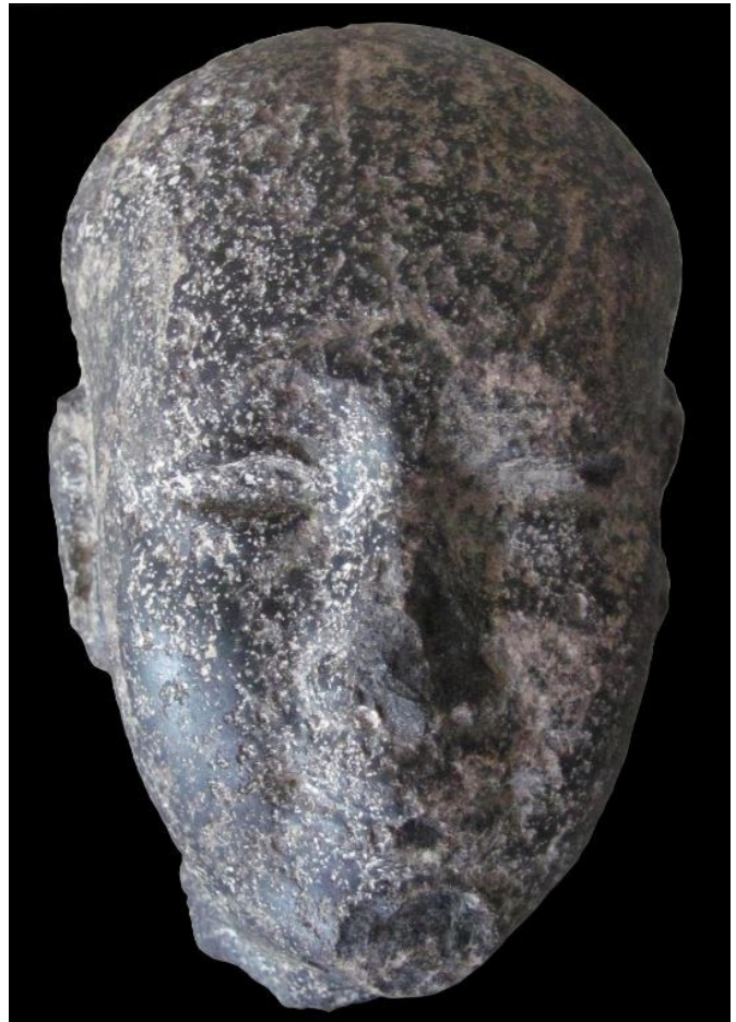
Figure 9: Ancient Egyptian head probably portraying an Isis priest. Dark granite. (IV century BCE).

NNO from km 14 of Via Nomentana), are mentioned by Giuseppe Guattani in 1806, reporting a letter of Ulisse Pentini who asserts to have found the statuette during a dig 29 . Ficulea gave back also a statue representing Harpocrates and found, in 1917, among the remains of a villa in Sant'Eusebio estate, 400 m N from Torre S. Eusebio 30 . The statue, acephalous and dated to the first half of II century CE (reign of Antoninus) 31 , is made of white marble (H 87 cm) and now at The Museum delle Terme di Diocleziano in Rome 32 . Harpocrates is represented as a naked child with chlamys holding a cornucopia of plenty with his left arm. The right arm, although not intact, provided the key identification of the character, based on iconographic comparison: in fact it bends toward the lacking head suggesting a finger on the mouth. In Greco-Roman era this kind of gesture was read as an invitation to be silent 33 but it was a misjudgment of the ancient Egyptian iconography employed to represent children, in particular Horus the Child , whereof Harpocrates was the Hellenistic adaptation. As son of Isis and Osiris/Serapis and personifying a deity with solar and agricultural peculiarities, he had a great spread inside Greco-Roman culture. Hence, the statue