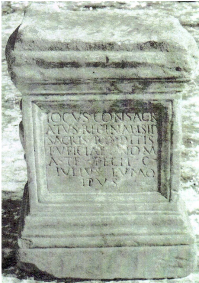
Figure 8: Altar mentioning Isis coming from Ficulea. In Lorenzo Quilici and Stefania Quilici Gigli, Ficulea , (Roma: CNR, 1993), site 231.