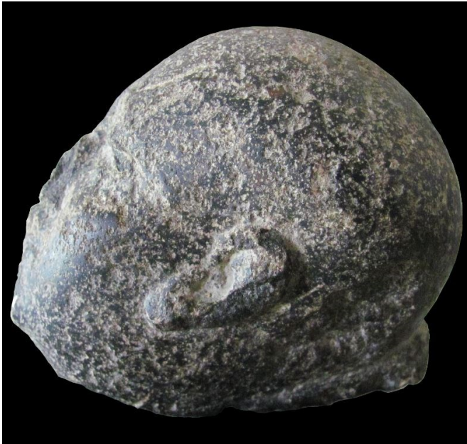
Figure 11: Ancient Egyptian head probably portraying an Isis priest. Dark granite. (IV century BCE).

would have been found in the area of Romitorio, near Casali di Mentana. This would confirm evidence for a worship of Isis and Serapis in that area along with the very widespread custom, typical