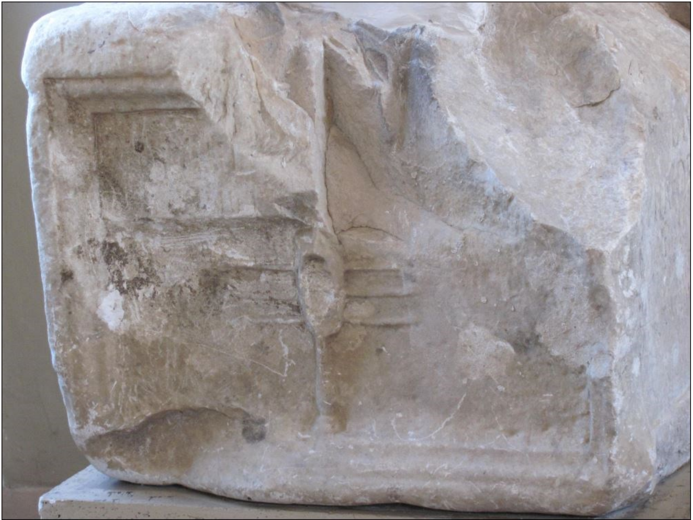
Figure 7: Altar mentioning a priest of Magna Mater coming from Vigna Santucci (Mentana, Rome). Detail with a sistrum . White marble (I-II century BCE).

Right side: Et Melizusae verna[e]/vixit annis XVIII posita hic a(nnos) XXX 23