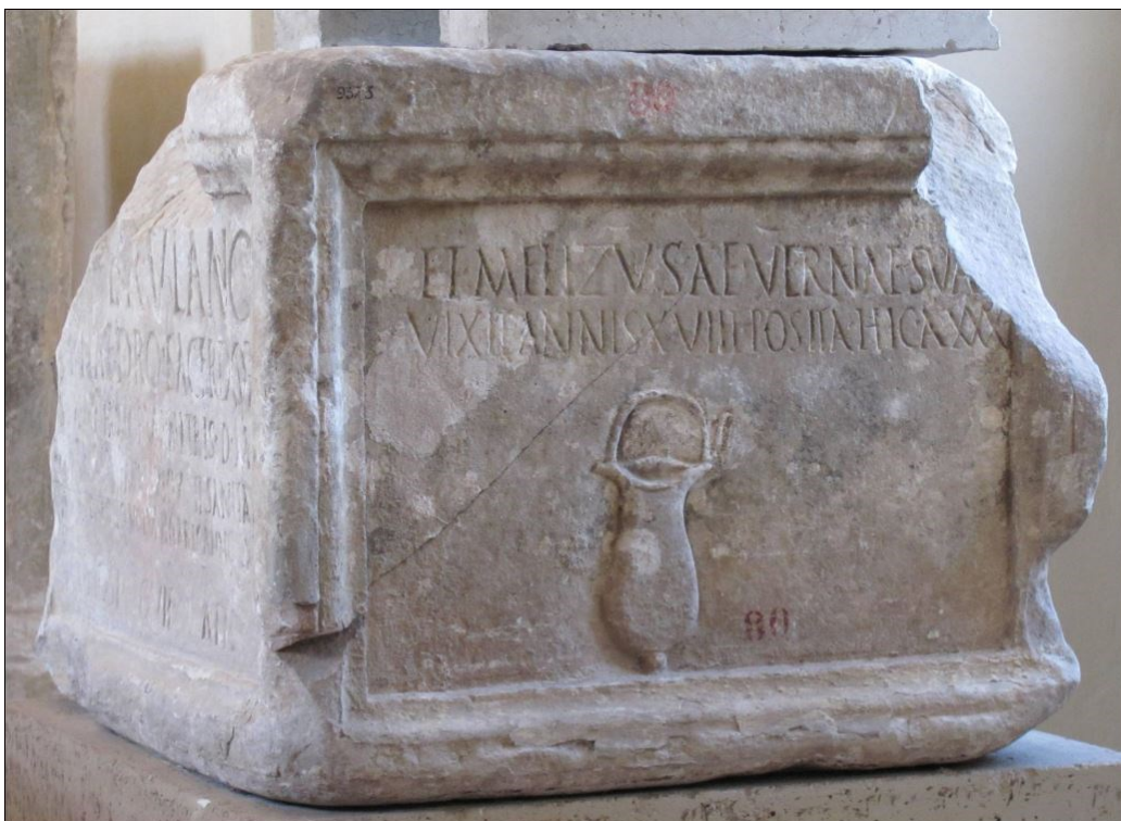
Figure 6: Altar mentioning a priest of Magna Mater coming from Vigna Santucci (Mentana, Rome). Detail with a situla . White marble (I-II century BCE).