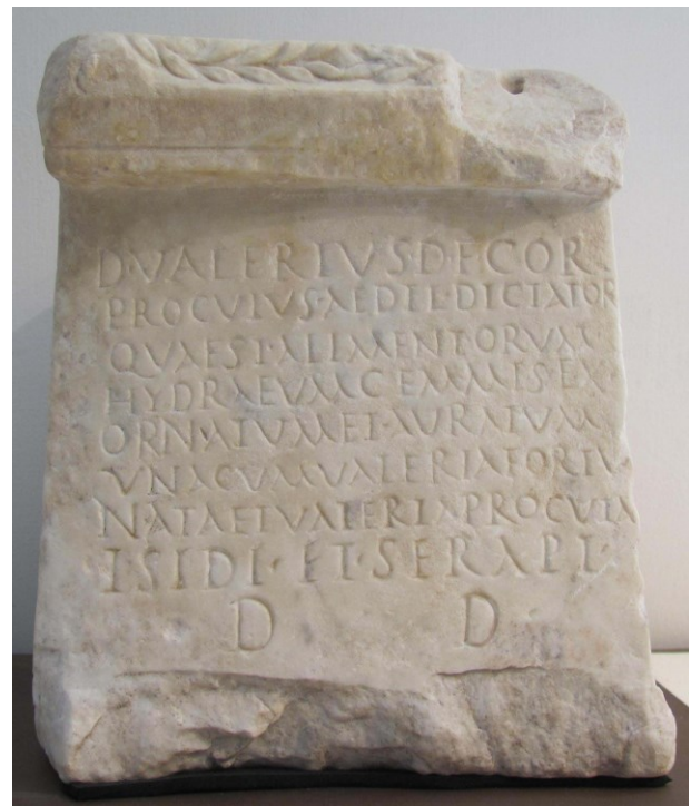
Figure 2: Little altar from Vigna Santucci (Mentana, Rome) with Latin inscription of Valerius Proculus. White marble (I century BCE).

The word “ hydraeum ” reveals the altar to be an important object of Isis cult as reported by various classic authors 17 : an hydria was a water jar very close in meaning to the situla , a kind of vase employed for libation rituals or funerary cult and considered to be the dwelling of god in form of water and for this reason object of devotion. The situla was brought in procession by priests bearing the vessel to their breast with veiled hands to respect its sacred