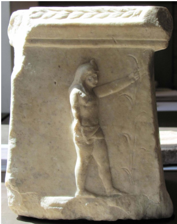
Figure 3: Little altar from Vigna Santucci (Mentana, Rome) with Latin inscription of Valerius Proculus. Detail with Egyptian priest grasping a tall trunk with long bowed leaves. White marble (I century BCE).

Front side: [V]erulano/Phaedro sacerdoti/ [N]omentanorum Matris D(eum) M(agnae)/[vixit] annis XXXV et sanitate/[...]omodo volui Hilaris annis LXX/ curios(a)e quit at te//