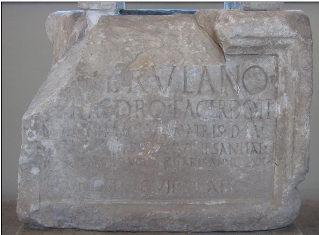
Figure 5: Altar mentioning a priest of Magna Mater coming from Vigna Santucci (Mentana, Rome). White marble (I-II century BCE).