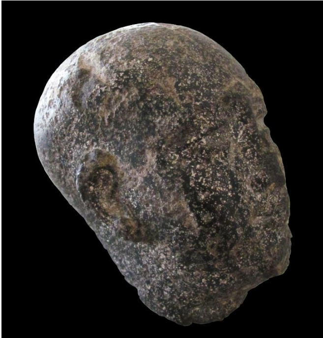
Figure 10: Ancient Egyptian head probably portraying an Isis priest. Dark granite. (IV century BCE).