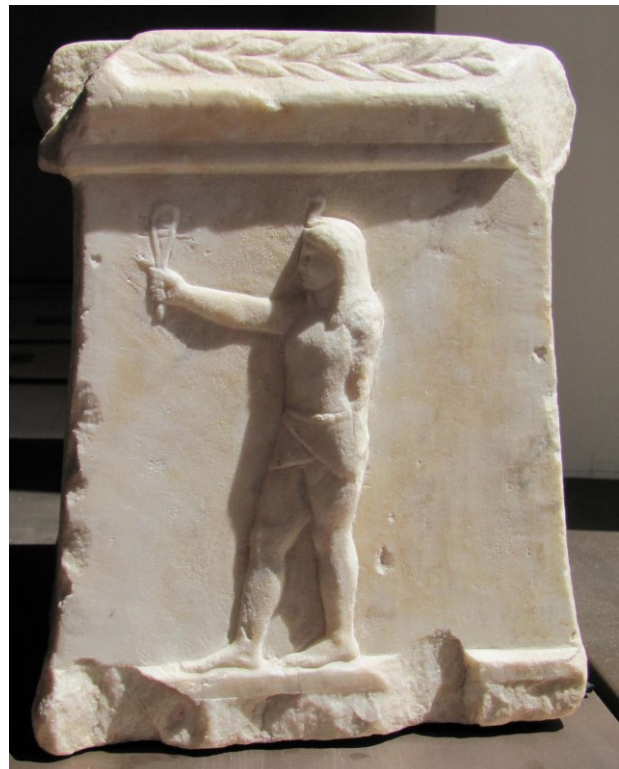
Figure 4: Little altar from Vigna Santucci (Mentana, Rome) with Latin inscription of Valerius Proculus. Detail with Egyptian priest holding a sistrum . White marble (I century BCE).