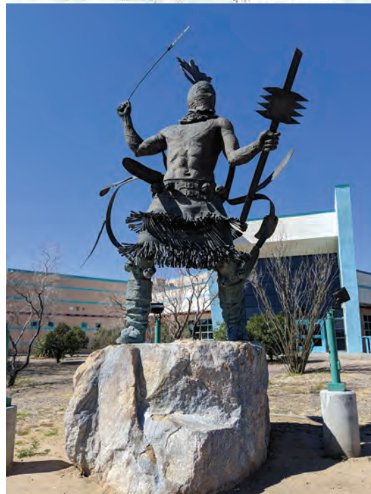
Top: Maximus' drawing that is featured on the cover of the magazine