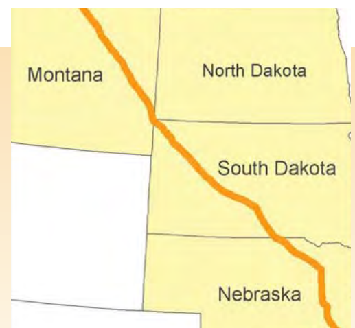
A map showing the proposed Keystone XL oil pipeline. // Sources: “Final Supplemental Environmental Impact Statement for the Keystone XL Project”; United States Department of State Bureau of Oceans and International Environmental and Scientific Affairs, January 2014

“If you see a problem or something that needs to be done, go do it,” he says. “Pay attention to what’s going on at home. Stay connected to your community, to the land. Most every Indigenous culture – our cultures – are the caretakers of the land.”