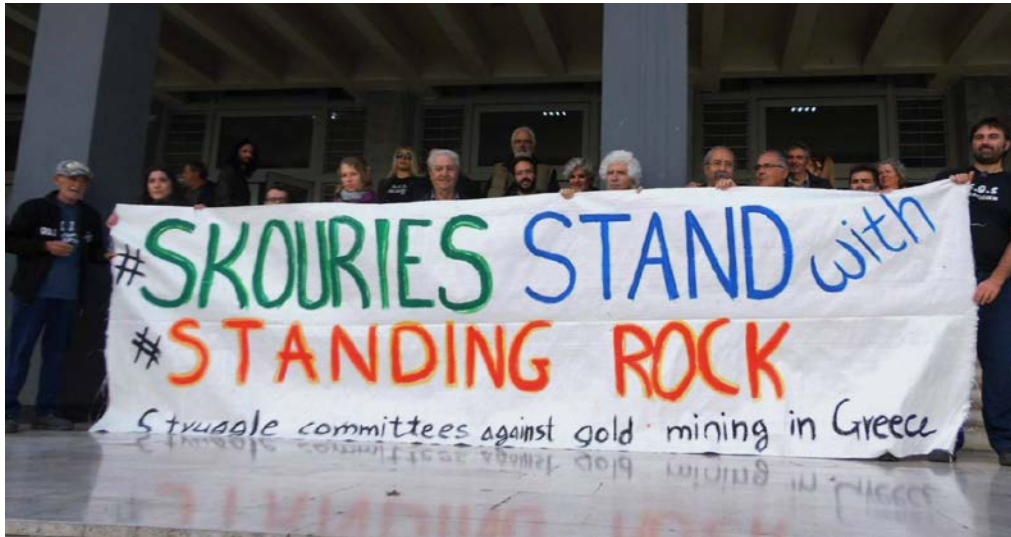
Figure 3. A banner held by Greek activists against gold mining, linking their struggle against mining to the struggle of Indigenous groups against the Dakota Access oil pipeline. On the day Barack Obama visited Athens in November 2016, the banner was placed in front of the building housing the US consulate in Thessaloniki, N. Greece.