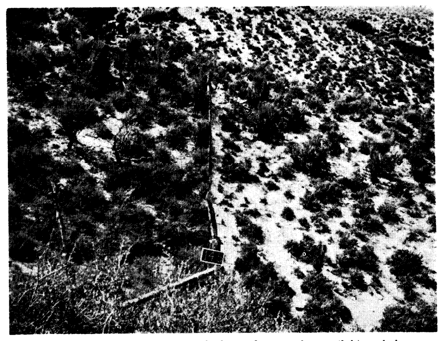
FIGURE 1. Gardner Creek exclosure, with the total-protected area (left) and the openrange area (right). Deer were responsible for the difference in browse. Photo taken in 1954.

In 1890, the range lands of Utah supported unregulated use by approximately 360,000 beef cattle and 2,000,000 sheep (Rasmussen and Gaufin, 1949). Heaviest livestock pressure on the ranges occurred from 1915 to 1920, as a consequence of the demands for meat created by World War I. Following that war, livestock reductions were effected, but concurrent with these reductions deer numbers were growing, so that total animal pressure was probably not much relieved (Julander, et al., 1950). By 1954, Utah's cattle numbers were increasing, while